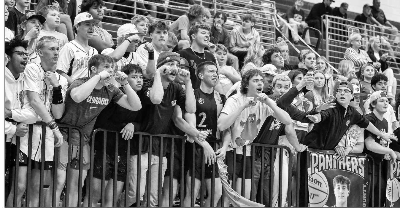
Up 30-17 early in the hometown and I'm not going Union County's student section came out in full force for last week's win over KIPP Atlanta.