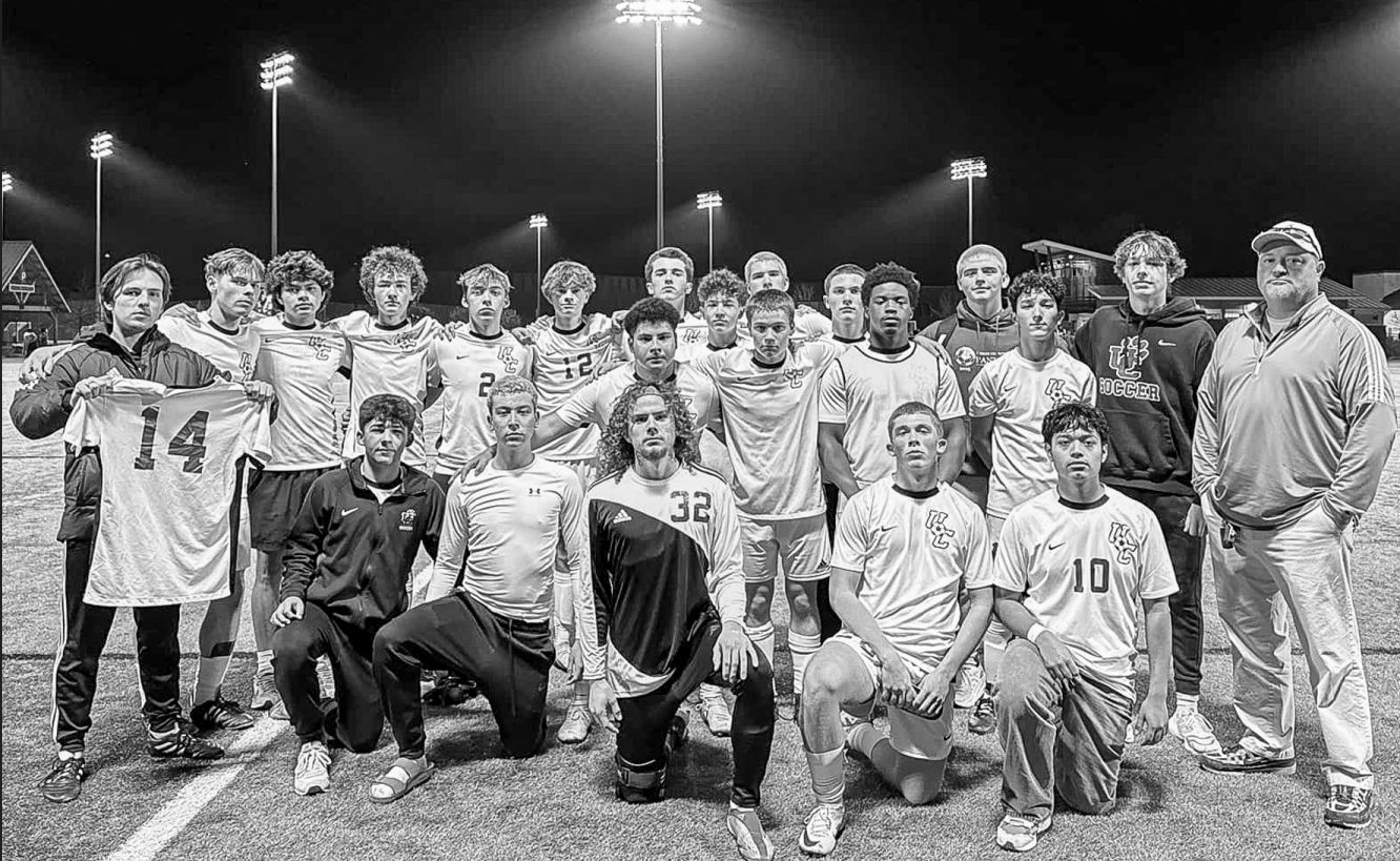
The Union County men's soccer team picked up a 4-0 Region 7-AA win at North Cobb Christian on Friday night. The Lady Panthers dropped a 4-1 contest earlier in the evening. Union County's hosts Ringgold on Tuesday in the 2025 home opener.