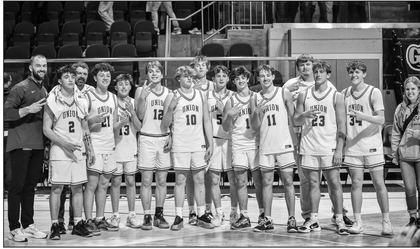
The Union County men punched a ticket to the program's first state title game in 54 years with a 54-38 win over Tattnall County on Friday at Georgia Southwestern State University in Americus.

The Panthers' historic playoff run continued last week